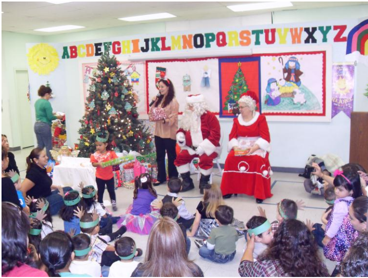
Children enjoyed their visit with Santa.

First Presbyterian Church, McAllen, was Su Casa's Christmas angel this year. The children enjoyed a fun-filled Christmas party on Wednesday, December 14, where Santa distributed the Christmas angels' gifts.